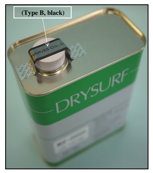
1). The cap of DRYSURF can (1kg) is sealed by Type B.

1). We will change seals to Type B (Black, 2nd ver.) for the products manufactured from September 1st, 2011. (First ver.= Type A, black)