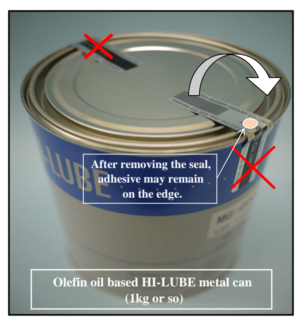
*. If you insert lubricator plate, adhesive may contaminate the grease.