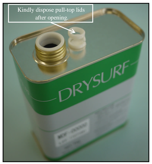
2). DRYSURF can with pull-top lid