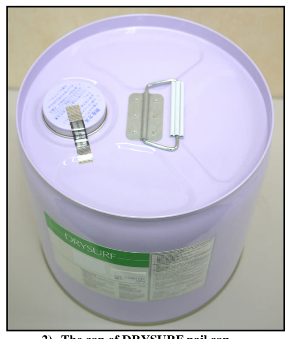
2). The cap of DRYSURF pail can is sealed by Type B.