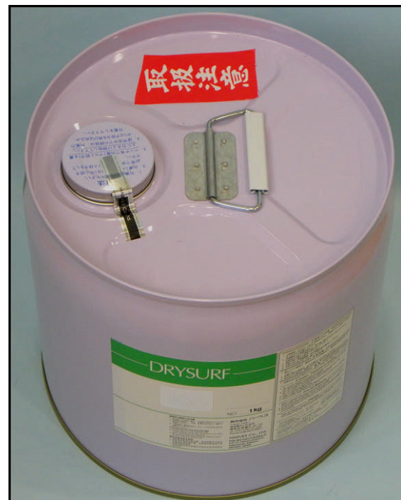
1). The cap of DRYSURF pail can is sealed.