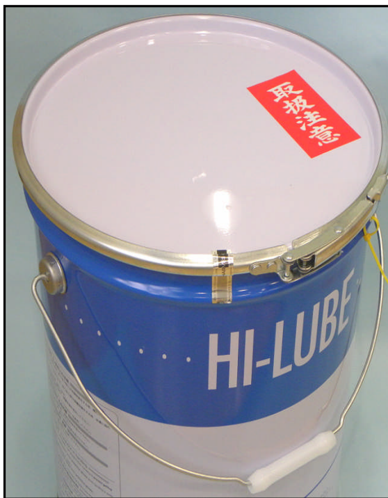
1). The lever band of pail with an open top is sealed.