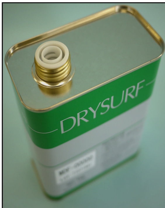
2). DRYSURF can with new pull-top lid.