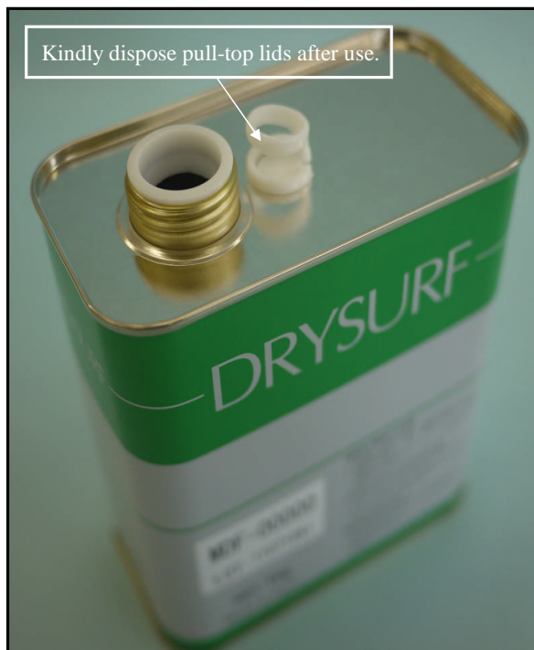
2). After opening a pull-top lid.