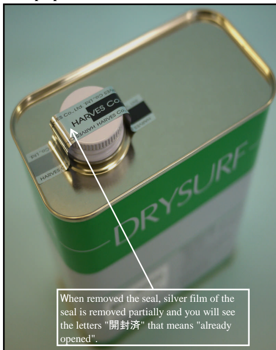
1). The cap of DRYSURF can (1kg) is sealed.