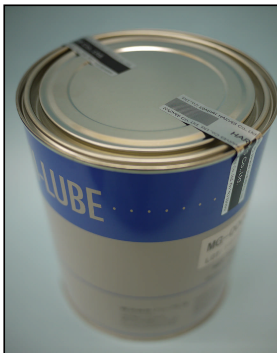
1). The cap of olefin oil based HI-LUBE metal can (1kg) is sealed.