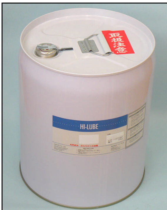
1). The cap of narrow mouthed pail can is sealed.